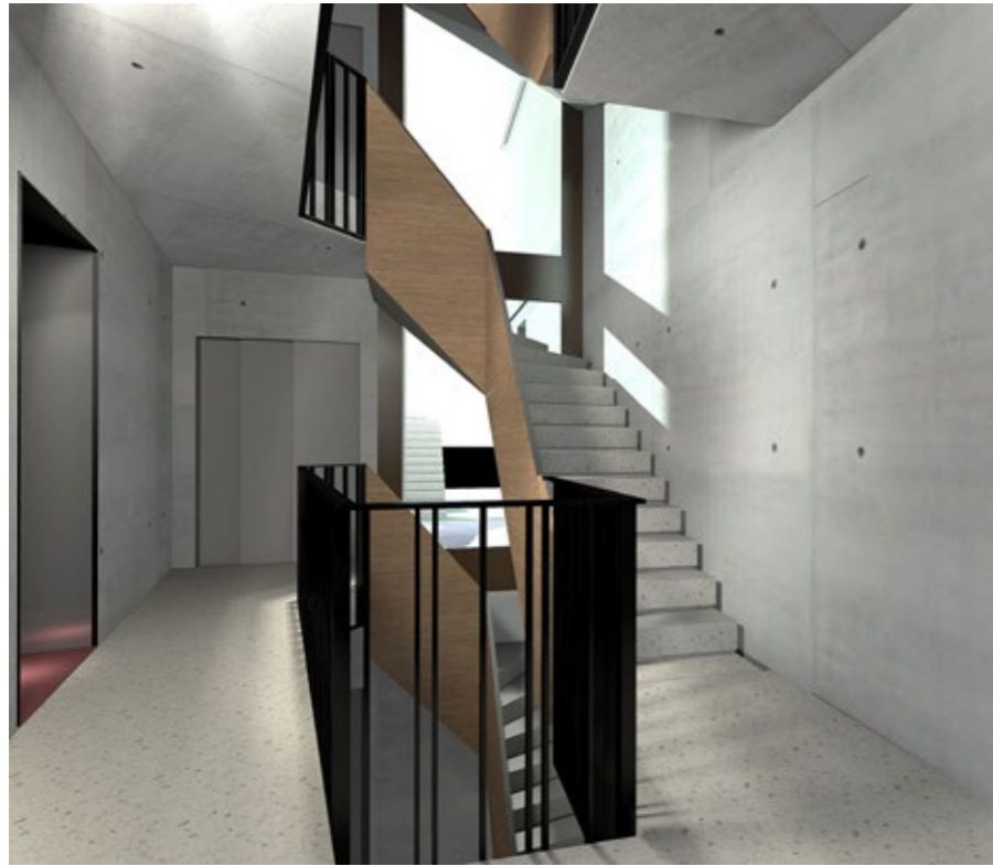
Entrance hall of the residence designed to hold a built-in letter box unit, a numeric bulletin board, a paper drawer unit with built-in handle and a bench.